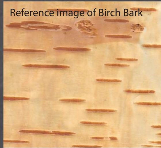
Reference image of Birch Bark

Inspired by my desire to use the laser cutter on campus, I made scale armor that was etched to appear as if made of birch tree bark. I did some samples of fully cut scales but didn't like the harsh laser line along the edge (1). The laser cutter did cut great lacing holes in addition to the etching so I cut my leather hides into strips and was able to quickly work them through (2). While using the laser I also etched some larger pieces of leather to be used in the pauldron. I saved a lot of time with the sections that were laser cut but each point was marked and cut by hand (4).